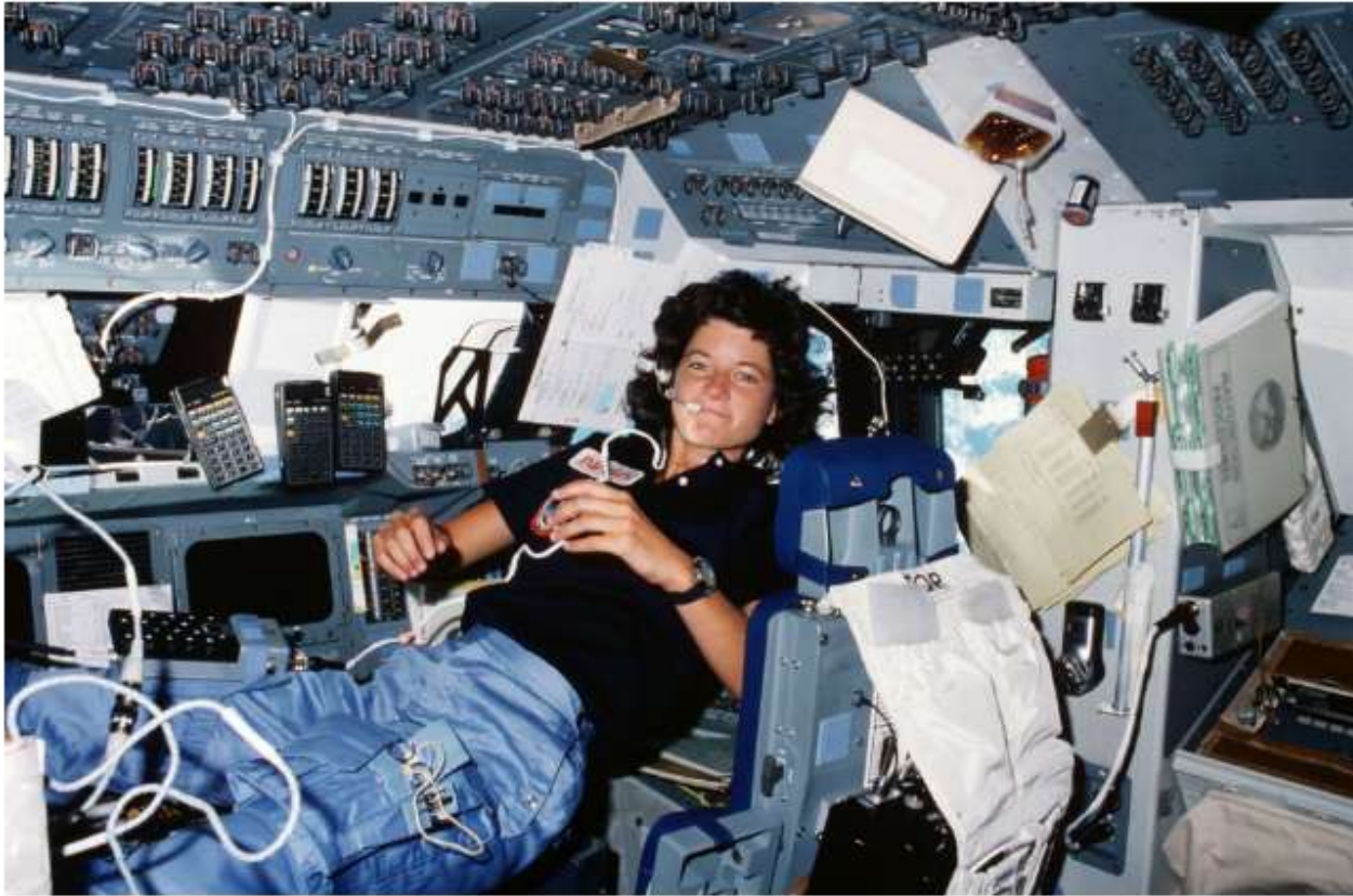
Floating freely on the flight deck, Sally Ride communicates with ground controllers in Houston during her STS-7 mission in June 1983.