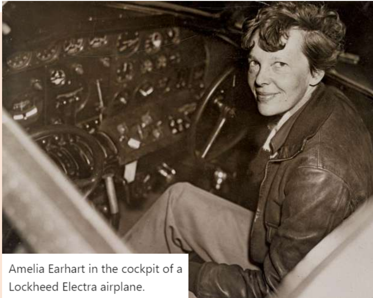
Amelia Earhart in the cockpit of a Lockheed Electra airplane.