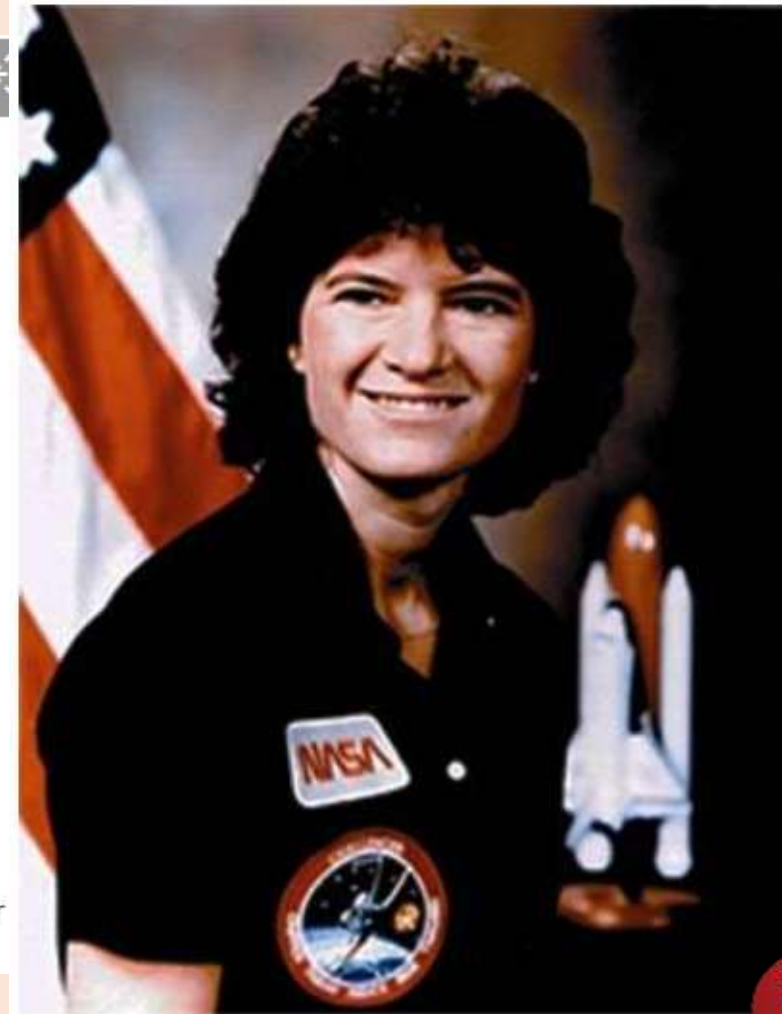
Sally Ride was in the first group of astronauts to include women.