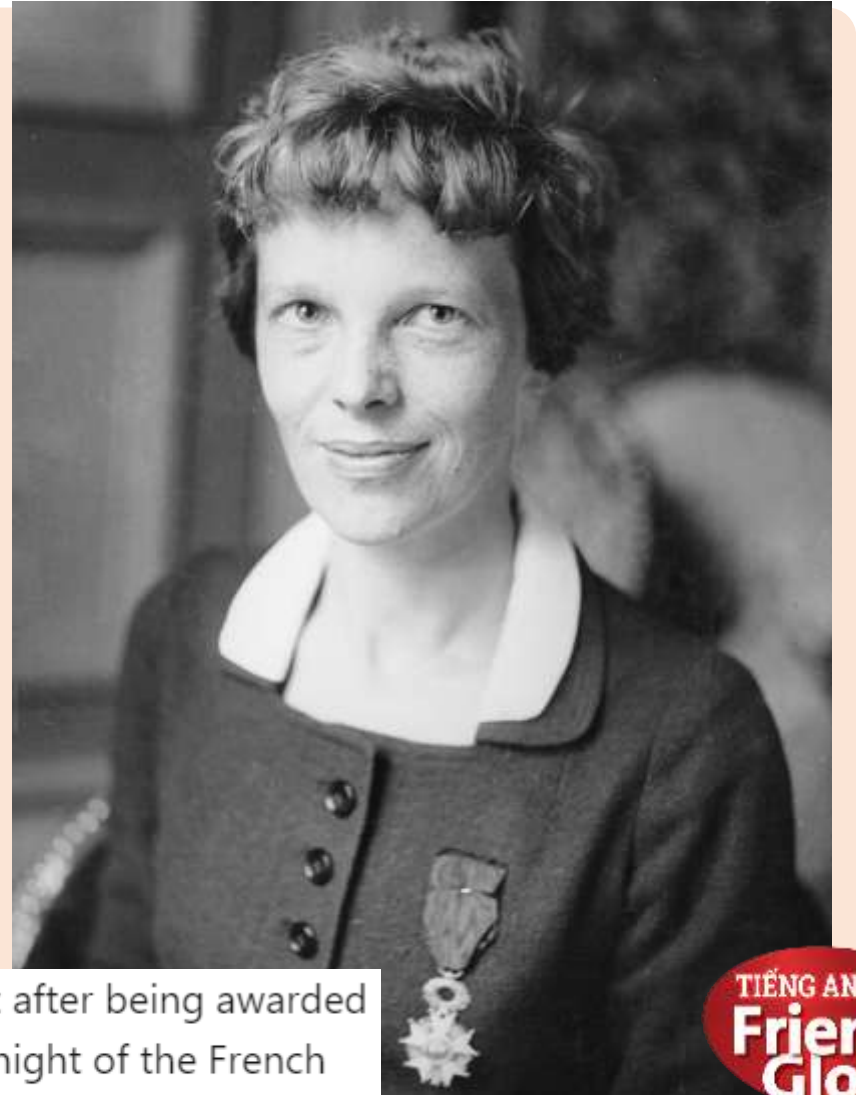
Amelia Earhart after being awarded the Cross of Knight of the French Legion of Honour, 1932.